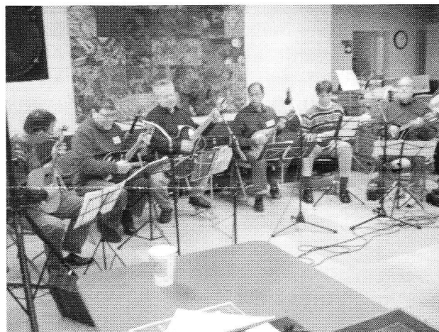
Mandolindy played while Society members went through the buffet line.